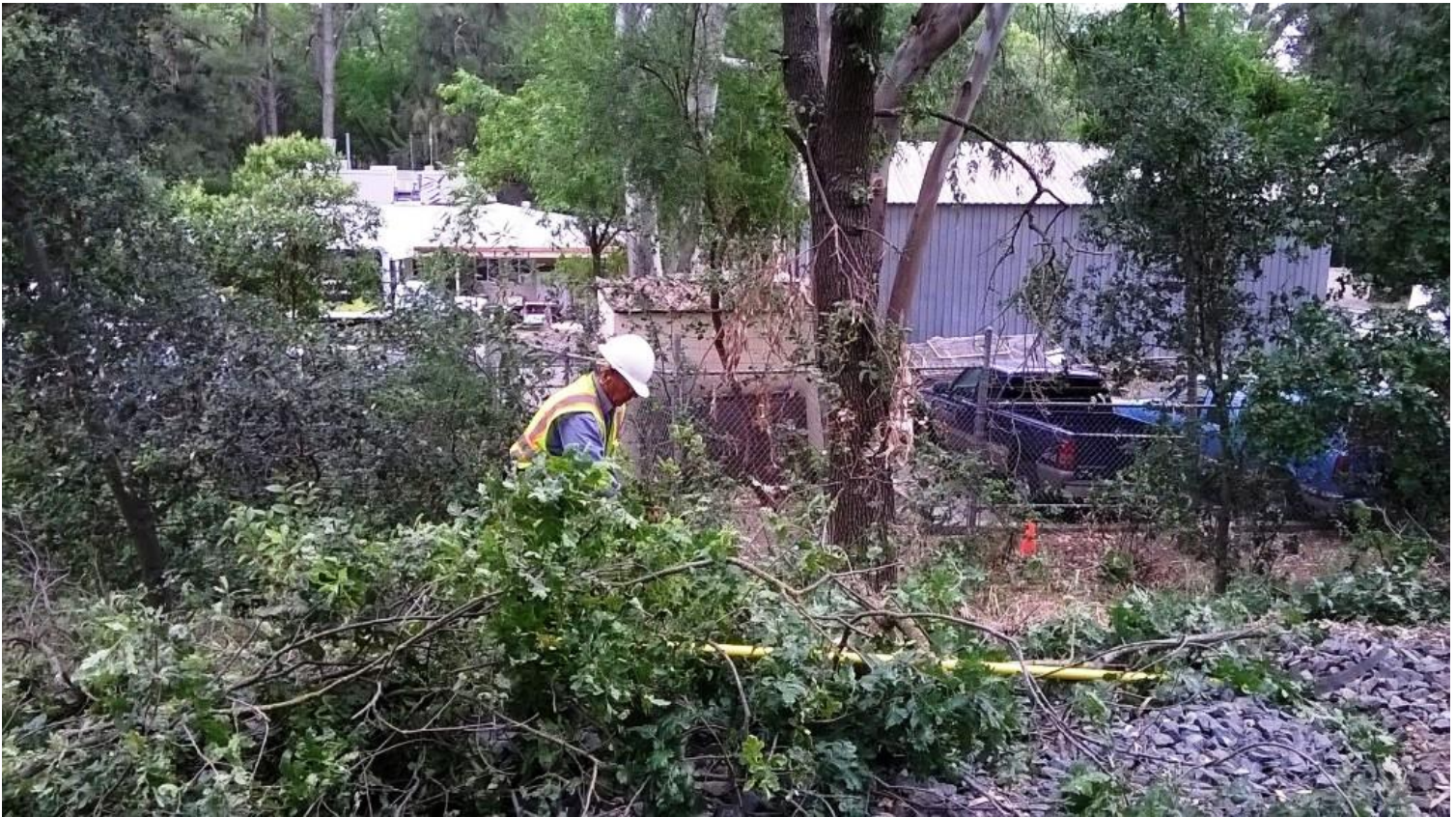
Mike clearing away trimmed limbs from the track adjacent to the Zoo