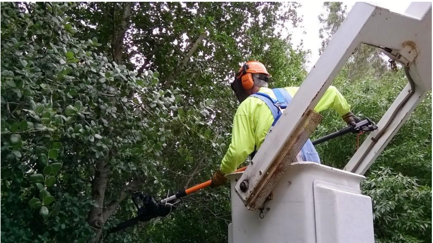
Dave, flying overhead in the man-lift's bucket, taking on the enemy