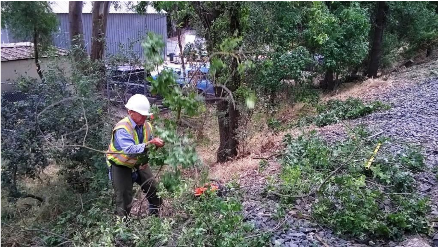
Mike removing green casualties from the right-of-way