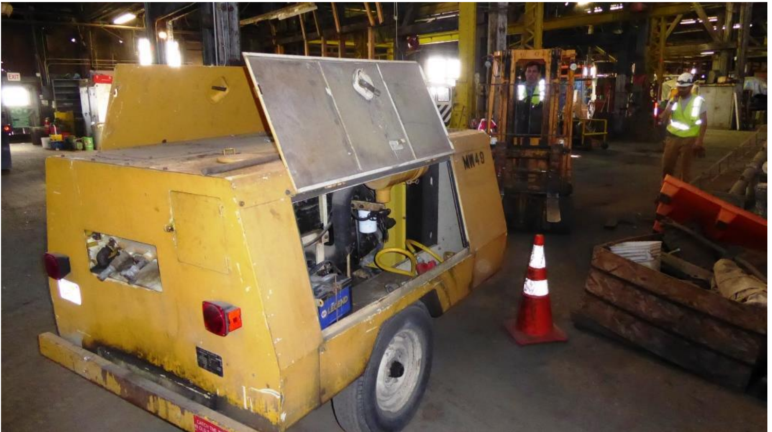
Weston on the forklift moves the tire-mounted air-compressor back to it's special place